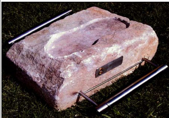
The Society’s Installation stone, created from the rear of the ground floor keystone of “Linden”, the former home of the First Chief of the then South Australian Caledonian Society

right foot placed in a carved footprint, usually on top of a promontory or similar. There are several of these carved footprints still visible in Scotland today.