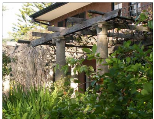
Part of the old Pergola at Linden

I retrieved the two keystones from the rubble and stored them for some twenty or so years, intending to incorporate them into a pair of gate posts to my front entrance. I eventually constructed these in 1986.