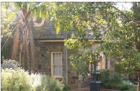
The Old Coach House at Linden

During the demolition, I approached the demolishers to ask if I might have the two hand-carved sandstone keystones above the windows on the ground and first floors. To this they agreed.