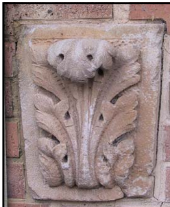
The left hand gatepost containing the keystone from the upper window

When the Society once again acquires its own “home”, the Installation Stone and the many other items of memorabilia will be able to be permanently displayed.