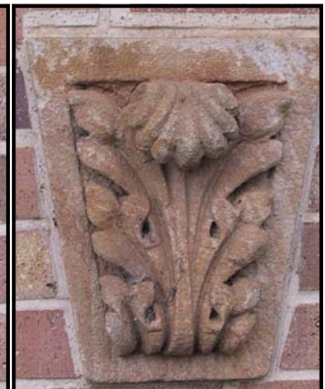
The right hand gatepost containing the keystone from the ground floor window