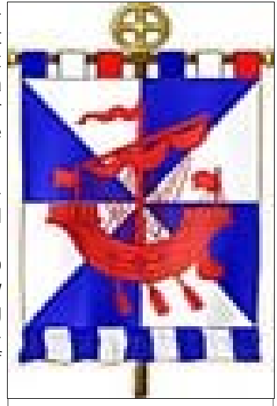
Glenfannon of Roman Catholic Diocese of Argyll and the Isles

Banner — On the other hand, a banner is a rectangular flag that is designed to be hung from a vertical pole. Early banners were wider than they were long. That is, the long side of the banner was attached to the staff. Later banners reversed this, so that they looked more like modern flags. In some areas, a long piece of fabric in the shape of a right triangle or rectangle hung from the upper corner of the fly-side of the banner.